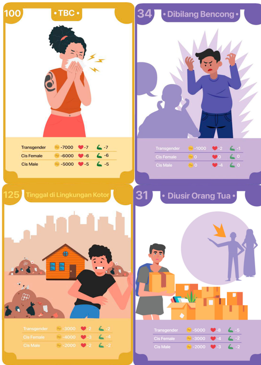
Figure 3. Boardgame cards by Sanggar Seroja highlighting crises frequently faced by transwomen. Clockwise from top left: Getting tuberculosis; Being called bencong (deeply derogatory term for transwomen in Indonesia); Living in a slum area; Being kicked out of your house by your parents. In each case, the crisis enacts an economic, health, and psychological cost that is dictated by gender.

strength to highlight the disproportionate impacts of climate change on women and sexual and gender-diverse people in Indonesia through visualising an alternative future, one of hope, inclusion, and power. They blur the boundary between research, art, and action – the characters are fictional, yet they engage in real-world transformation,