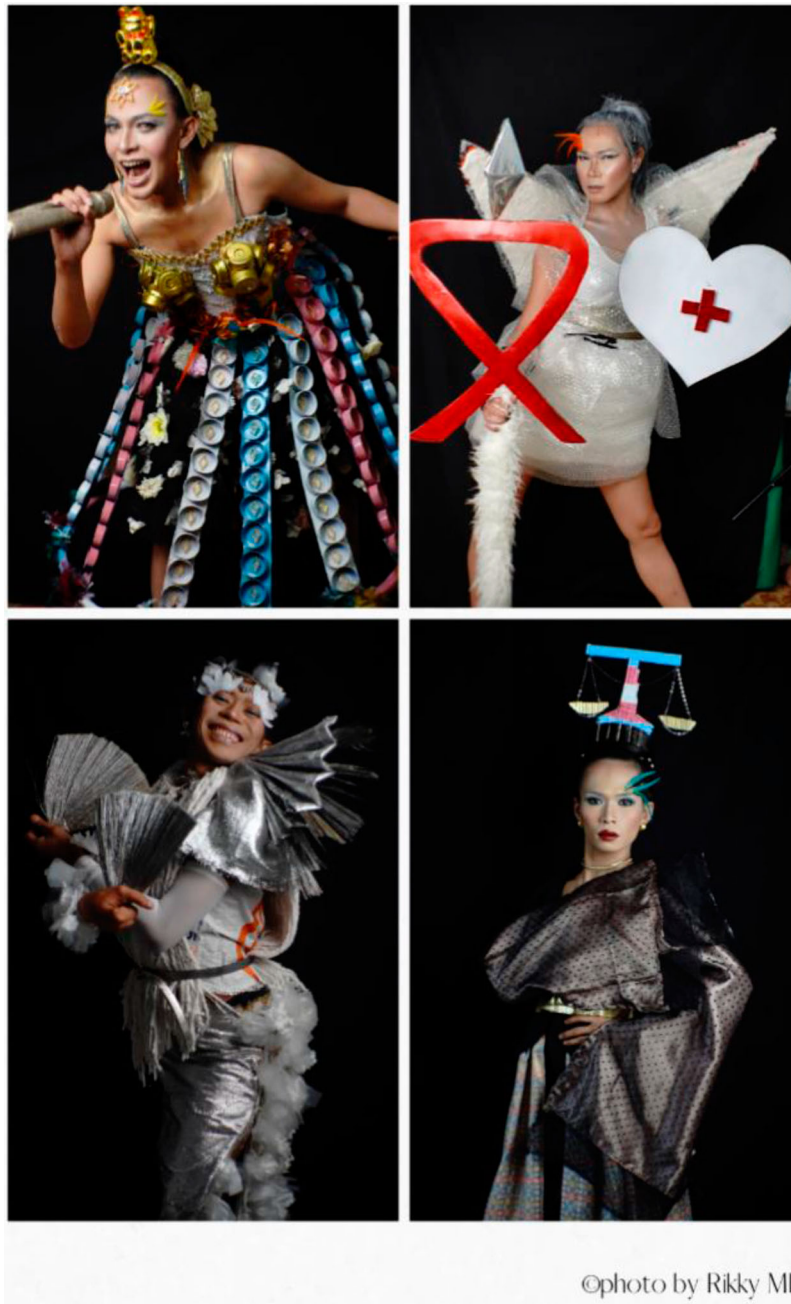
Figure 1. Trans Superhero Perubahan Iklim by Sanggar Seroja.

To lift these characters off the page and put their politics of hope into action, we facilitated training for Sanggar Seroja members in advocacy, human rights and paralegal processes, grant management, and livelihood skills including harvesting eco-enzymes from organic waste products and using (and selling) these for medicinal, beauty, and household cleaning products. These skills training needs and the activists who delivered