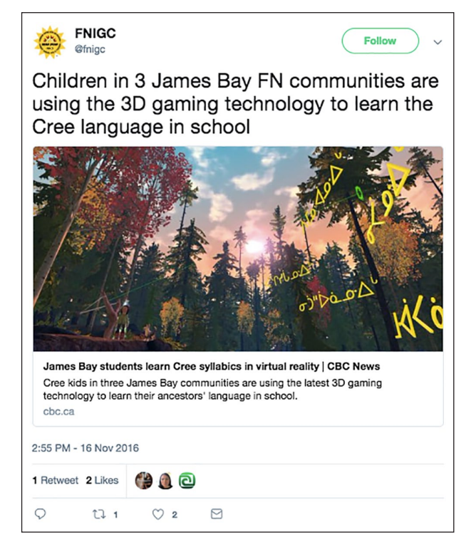
Figure 1. @fnigc tweets about how 3D gaming technology assists James Bay FN students learn Cree language in school. FN: First Nations; Cree: Indigenous people of northern plains region of North America.

teaching the connections between Indigenous lands and Indigenous languages. A tweet by @fnigc illustrates this type of land-based cyber-pedagogy, by showing how children in three James Bay First Nations communities are engaging with virtual reality technology that enables them to digitally move through vivid three-dimensional (3D) recreations of their homelands while they learn their language (Figure 1).