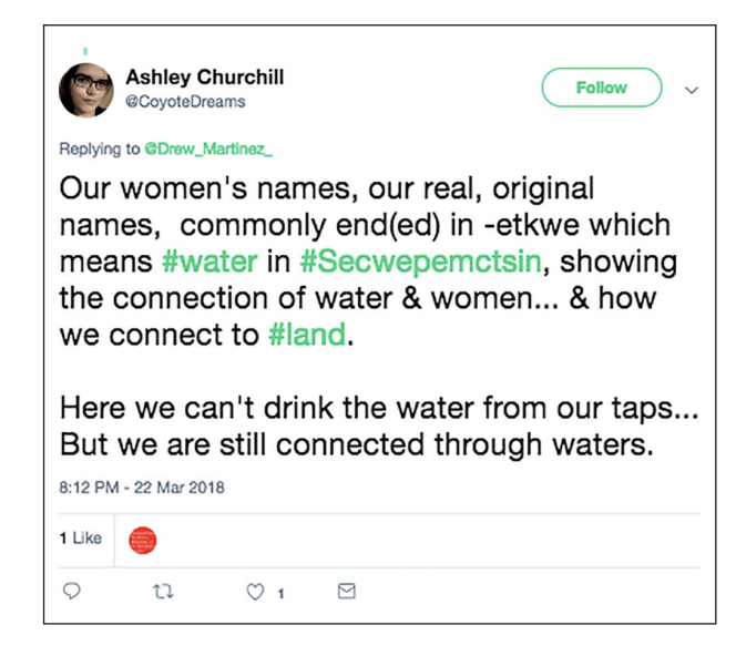
Figure 3. @CoyoteDreams tweets about women's names and connectedness to water.

Secwepemctsin: Indigenous people of interior region of British Columbia in Canada.