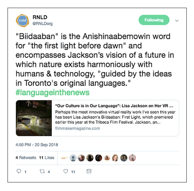
Figure 5. @RNLdorg tweets "the first light before dawn" as a translation for the Anishinaabemowin word "Biidaaban." Anishinaabemowin: the language of the Annishinaabe people, an Indigenous people in the Great Lakes region of North America.

territorial re-constitution and neo-constitution made possible through these projects can shape how Indigenous Twitter users make films for the purposes of language reclamation on and through Twitter. It is vital to make the distinction that for some Indigenous people, these are re-constitutions, that is, resurgence, reparative, and reclamation efforts, while for others, largely due to colonial history, this is their first engagement with Indigenous language and land.