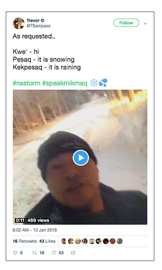
Figure 4. @Tsanipass tweets translations for three Mikmaq words.

Digital technologies, especially those which draw on audiovisual capability, make for useful materials which help to bridge Indigenous peoples to places, and particularly ancestral homelands. We see this as especially useful in the context of distance, especially for those who by virtue of either choice or alienation find themselves at great distances from their homelands. While not yet widespread, these immersive engagements by Indigenous peoples to virtually visit their lands are precursors to the possibilities of experiences like that offered by augmented or virtual reality